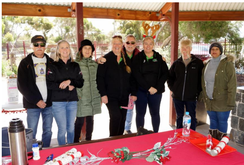
Christmas At The Willows