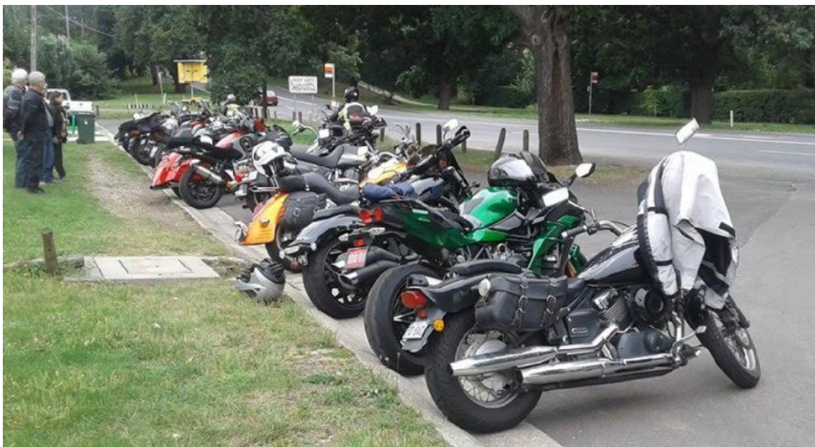
Big line-up for today's ride..