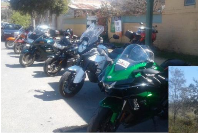
20180901 Saturday ride Some more shots